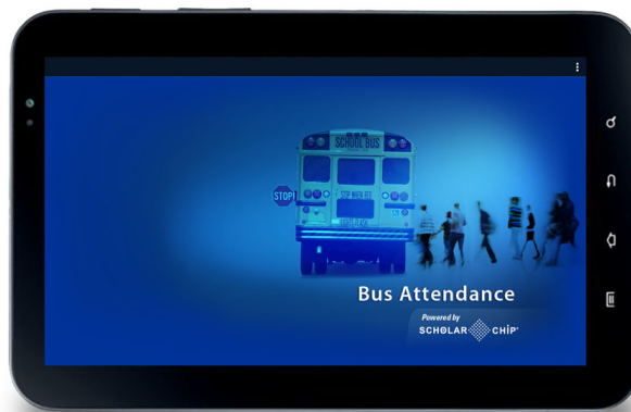
Dash-mounted tablet is viewed by the bus driver who can see student photos as they tap onto the bus

All attendance data is available to the bus driver and school administrators